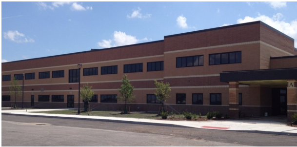
Hanover Central Middle School Opened Fall 2012