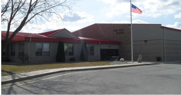
Jane Ball Elementary