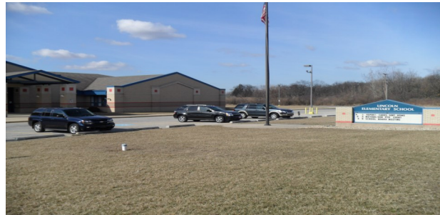
Lincoln Elementary School