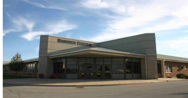
Hanover Central High School